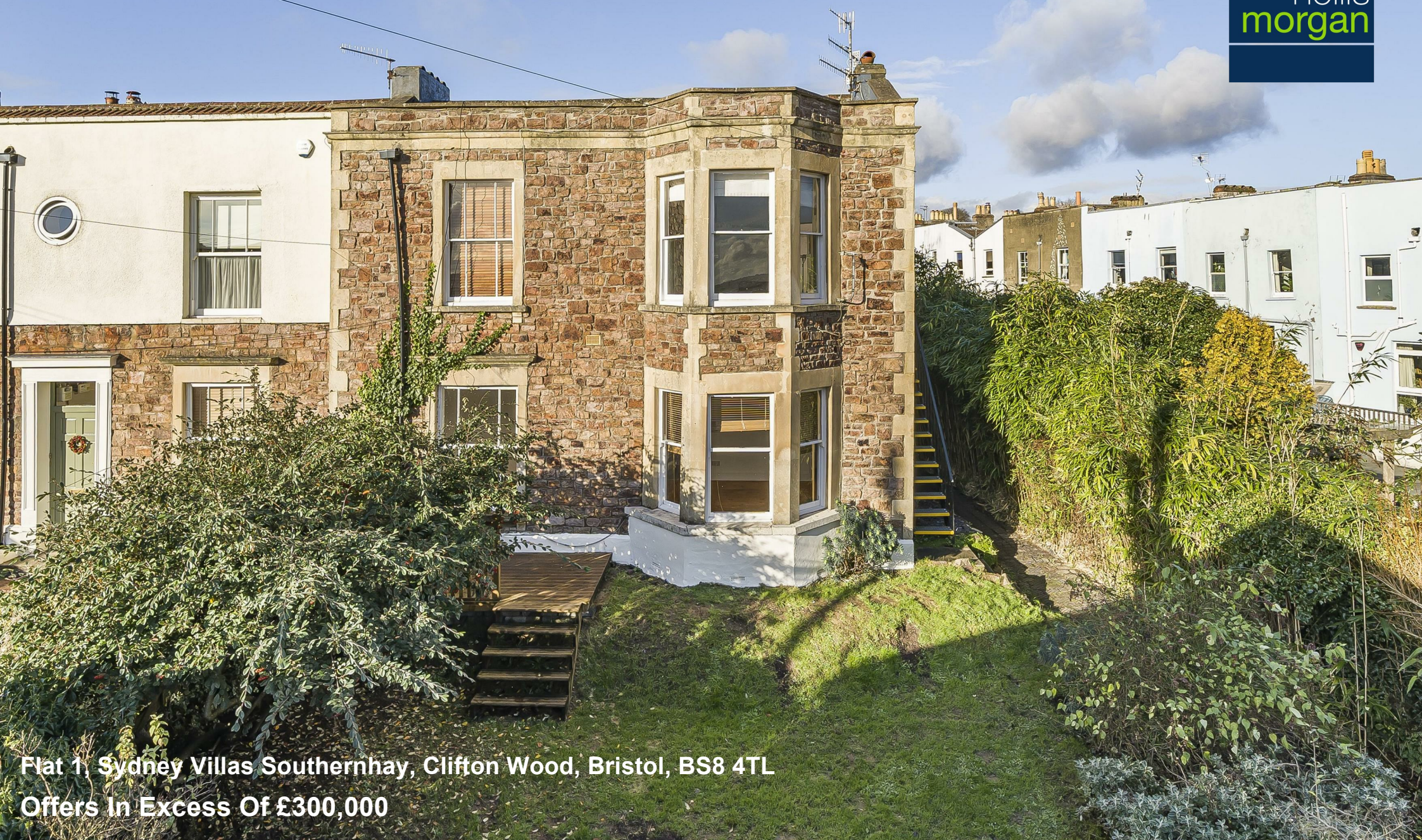
Flat 1, Sydney Villas Southernhay, Clifton Wood, Bristol, BS8 4TL Offers In Excess Of £300,000